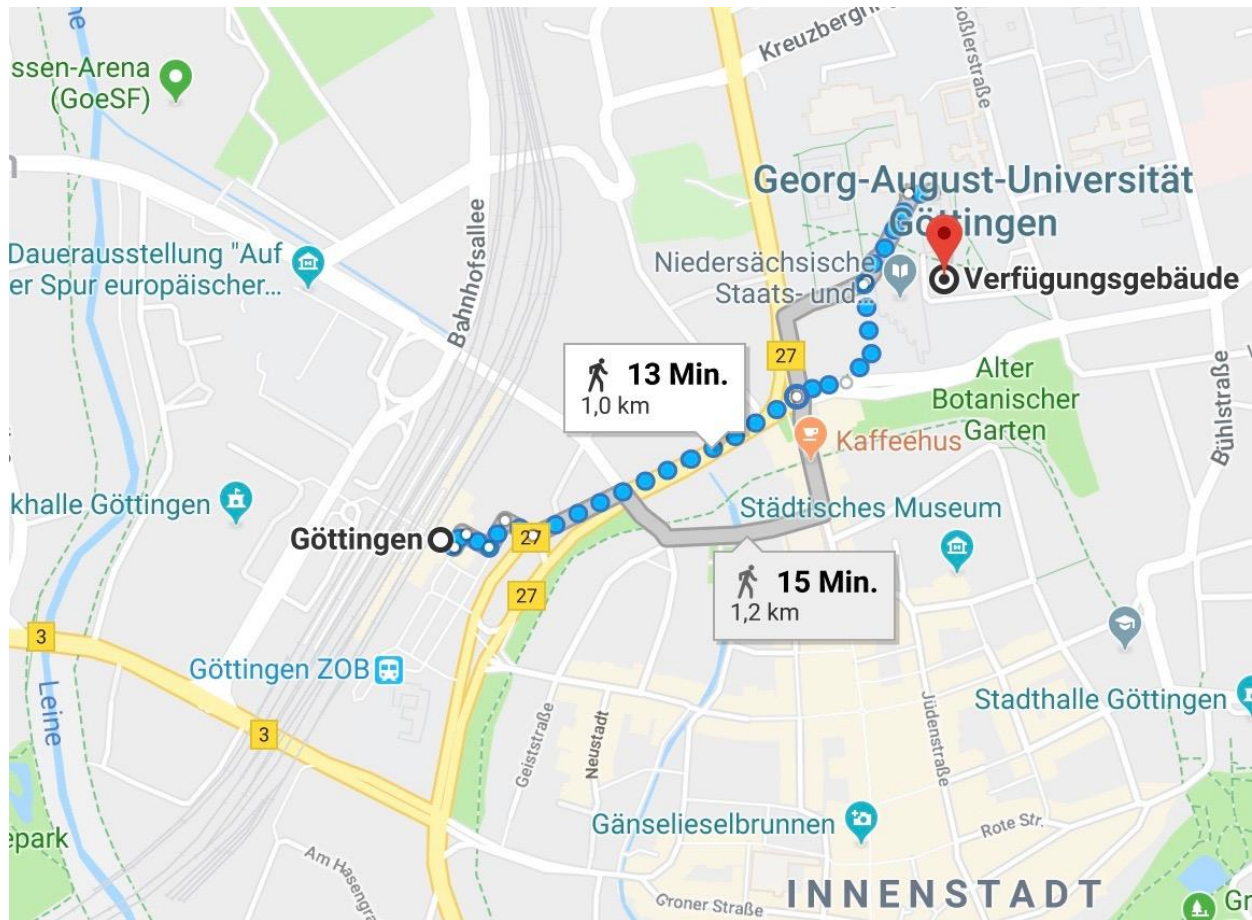
(Map: Directions from Göttingen Train Station to University Göttingen)